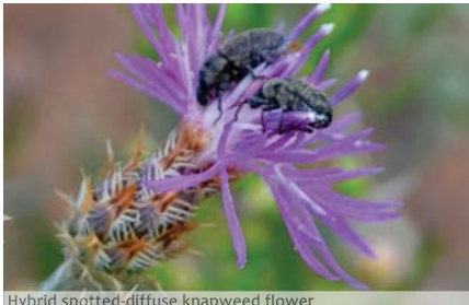
Hybrid spotted-diffuse knapweed flower